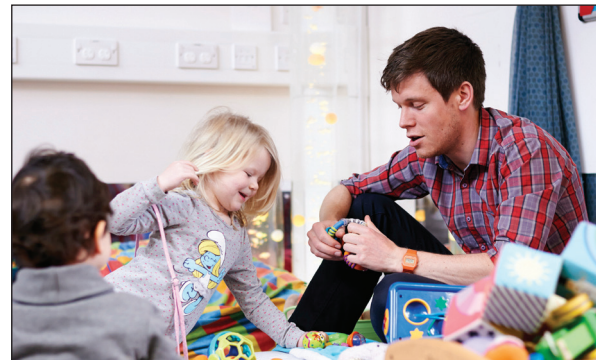
Charity number 1132581 | Company number 6952404