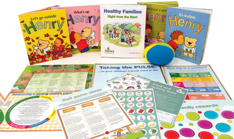
The HENRY Parent Toolkit – free to everyone joining a HENRY programme

The HENRY toolkit will help you give your child a great start in life, get the whole family involved, and keep track of how well you're doing.